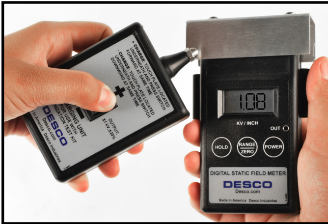
Figure 8. Taking decay measurements

IMPORTANT: A ground path must be provided between the touch plate of the Charger and the ground reference of the Field Meter. This is normally provided by holding the Charger in one hand and the Field Meter with Conductive Plate in the other.