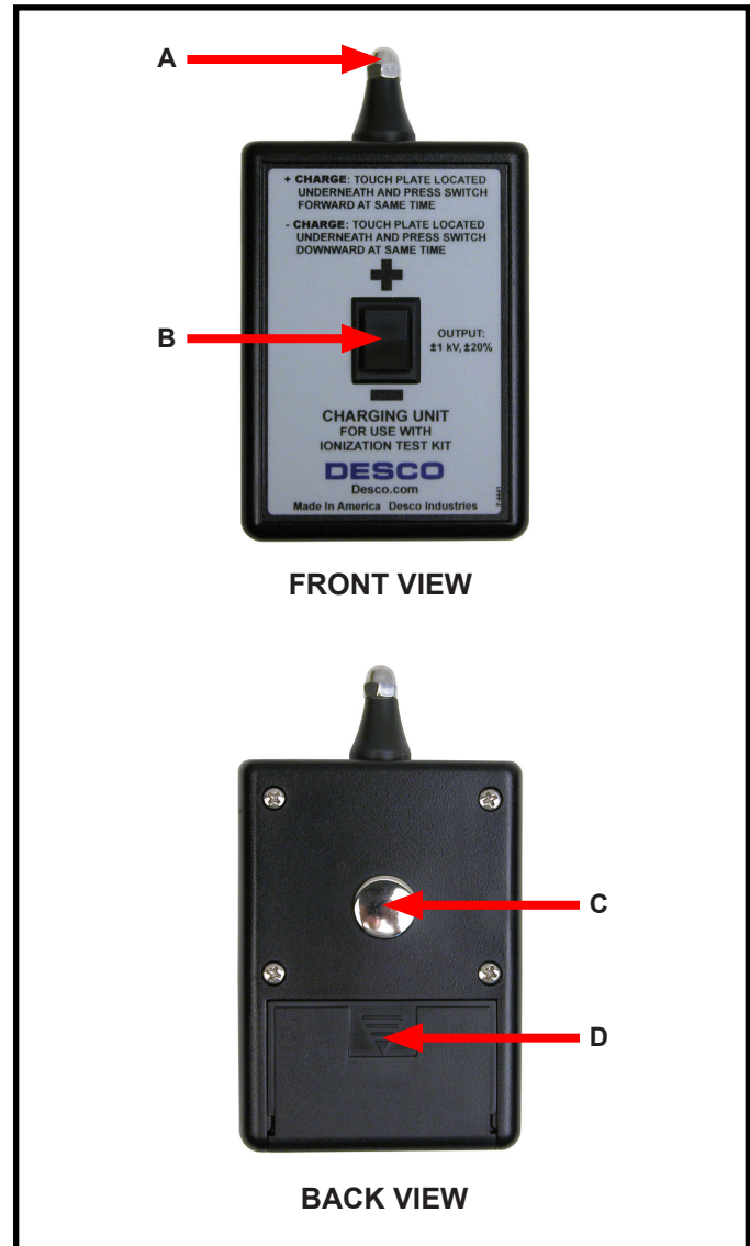
Figure 3. Charger features and components

A. Output Contact: The output contact is connected to an internal power source. When the touch plate located underneath the unit is connected to ground, the output contact will provide a charge of the indicated polarity. The charger is designed so that an operator can press the rocker switch and touch the plate simultaneously with the fingers of the same hand.